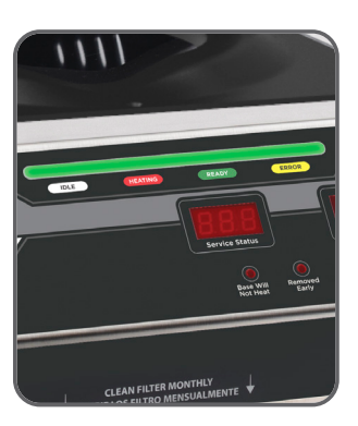
4-color LED status light and automatic voltage calibration.