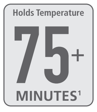
When used with heated plates and Radiance<sup>®</sup> high performance domes.