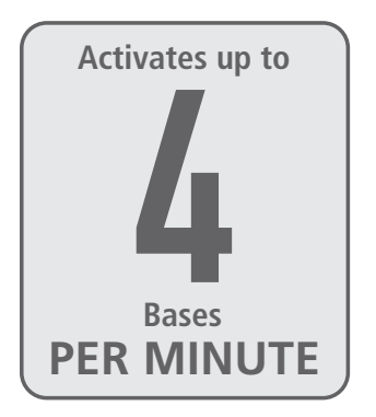
Fast 15 second cycle time.