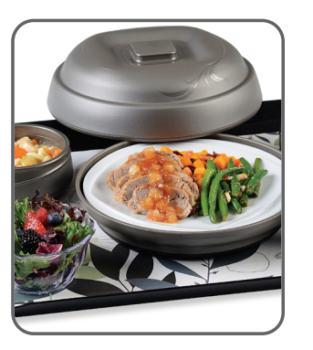
Serve patients highest quality meals at ideal temperatures.